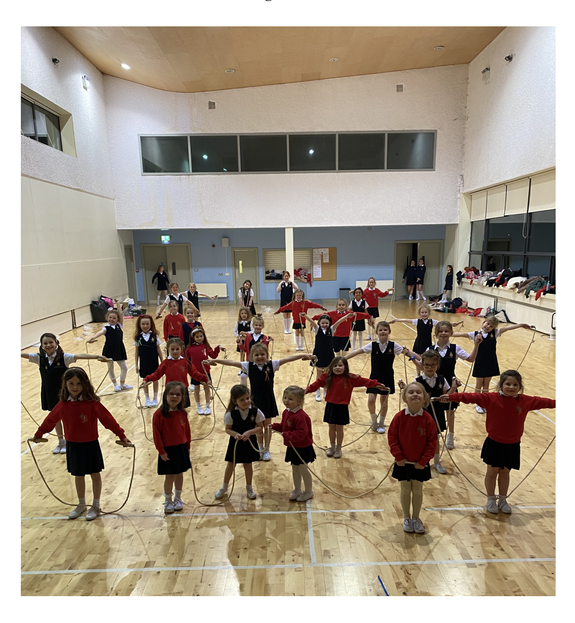
45th Co. Girls Brigade Swords/Donabate

Instead, all are welcome to attend the 10am joint service in Saint Patrick's Church in Donabate.